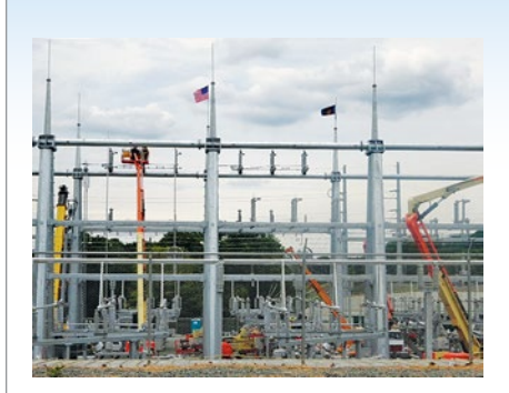
IBEW Local 42 members working with McPhee Electrical Contractors are building a new substation in Chicopee, MA.