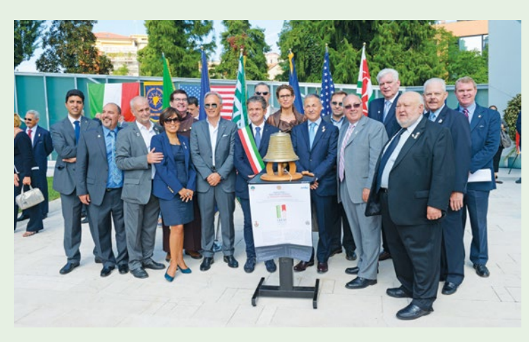
A group of IBEW union leaders and representatives joined Italians for a 9/11 commemoration in September in Padua, Italy.

Members of Local 3's Sword of Light Pipe Band played bagpipes for an honor