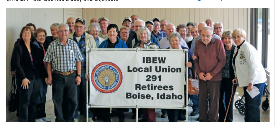
"Season's Greetings from Local 291 Retirees Club, where all are welcome."