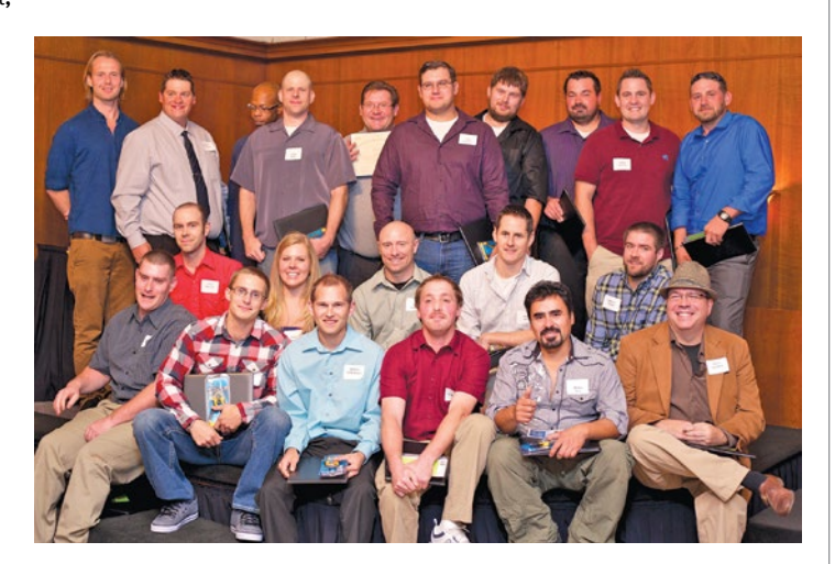
Local 292 Minneapolis JATC 2013 apprenticeship graduates.

Nevertheless, even with very few projects to bid, Local 280 continues to secure sizable projects within our jurisdiction.