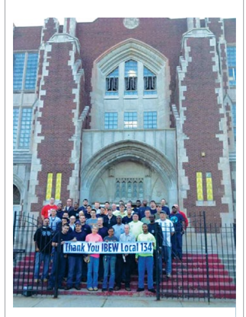
IBEW Local 134 volunteers on the steps of St. Margaret of Scotland School.