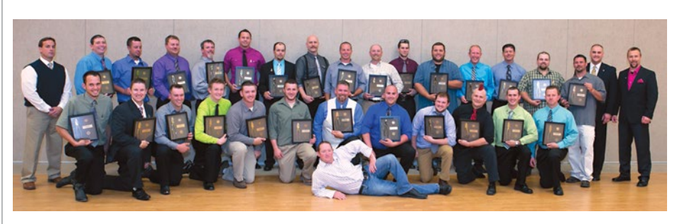
Local 146 congratulates the Midstate Electrical Training Center class of 2013 apprenticeship graduates.

The ride concluded the second day at Local 222 with a grand barbecue. Local 222 thanks the sponsors that helped make the Labor Day Bike Run such a success. Riders wore T-shirts displaying