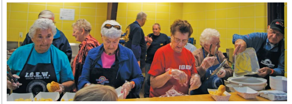
Local 110 Retirees Club assists with preparations for the local's annual family picnic.

RETIREES CLUB OF L.U. 110, ST. PAUL, MN—More than 900 members and their families attended the annual IBEW Local 110 Family Picnic. Local 110 retirees cooked and served hamburgers, hot dogs, shredded pork, popcorn and beverages at