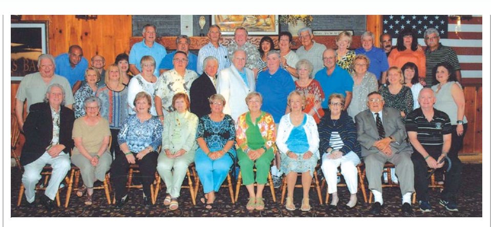
Local 3, North New Jersey Chapter, Retirees Club enjoys trip to Woodloch Pines in Hawley, PA.